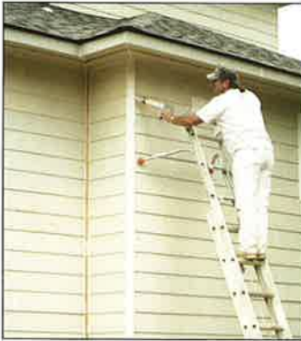
Paint and Make Repairs Safely.