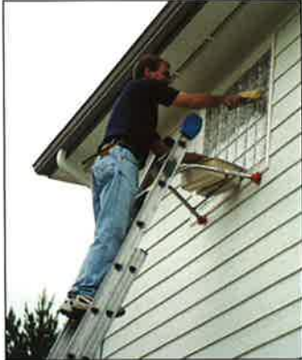
Use For Sidewall Work.