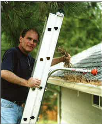
Install and Clean Gutters Safely!