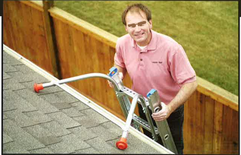
Protect Gutters or Roof Edge.